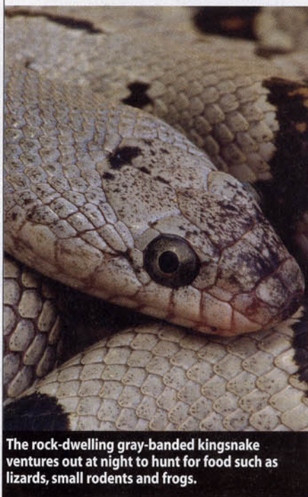
The rock-dwelling gray-banded kingsnake ventures out at night to hunt for food such as lizards, small rodents and frogs.