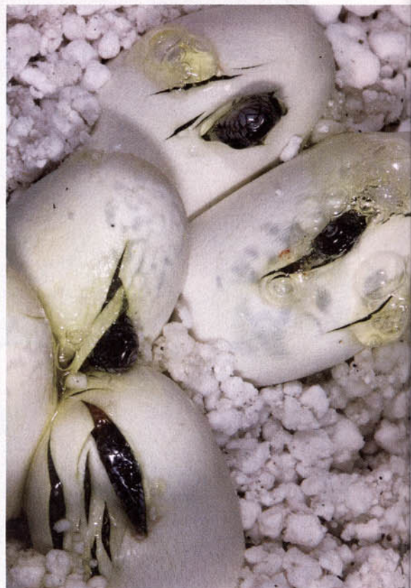
Hatchlings usually take 24 hours to fully emerge from their shells after pipping.

basic strategies that should increase your chances for breeding these wonderful colubrids.