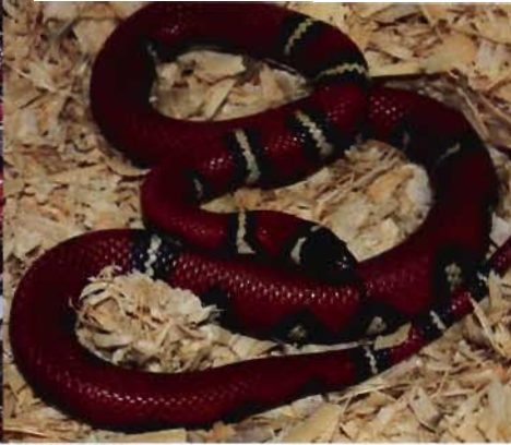
An aberrant Tapalpa, Mexico, L. ruthveni .

breeding during the last two decades has produced many Nuevo Leon kingsnakes that do not resemble their wild parental stock. Other than the simple recessive melanistic gene, there are no known recessive, dominant or co-dominant morphs, but morphs are not needed for a variable, unpredictable clutch of neonates. Leonis, MSPs and melanistics have been known to hatch out of one clutch of eggs. Many captive Nuevo Leon kingsnakes resemble their wild descendants, but through line breeding, captive leonis express very clean and bright coloration. Recently, there have been a number of aberrant neonates resulting from line breeding and selective propagation.