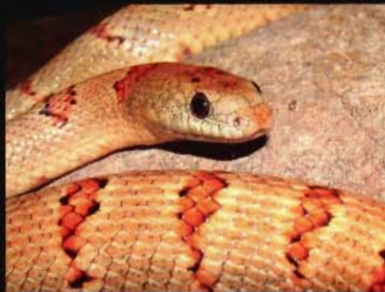
Reduced-black buckskin leonis phase L. m. leonis .