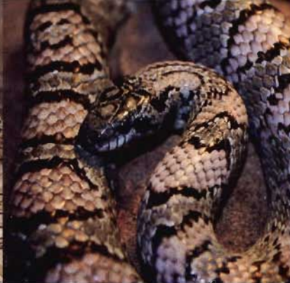
Hypoerythristic (reduced-red) Mex-Mex.

Durango Mountain kingsnake is greenish/gray to tan. It typically has narrow red saddles outlined in black. They have a distinct nuchal blotch that distinguishes them from thayeri as well as a head coloration that is the same as their ground color. The only variations from the Rancho Santa Barbara captive stock are a light phase and hypomelanistic morph. One greeri breeder produced a striped neonate but was never able to prove out the striped gene as a genetic trait. It was declared an anomaly resulting from temperature and humidity fluctuation.