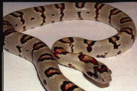
Hallow or ghost-saddled leonis phase L. m. leonis .