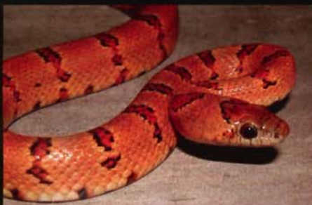
Orange leonis phase Lampropeltis mexicana leonis "thayeri."