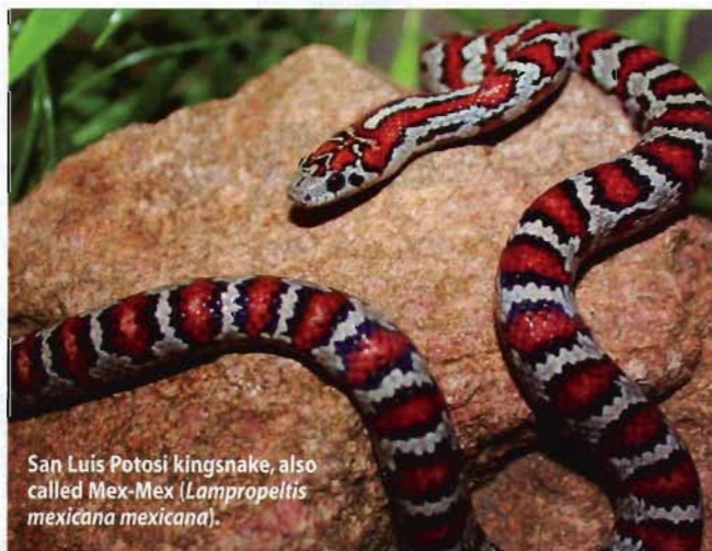
San Luis Potosi kingsnake, also called Mex-Mex ( Lampropeltis mexicana mexicana ).

in the Mexican states of San Luis Potosi, Aguascalientes, Zacatecas and Guanajuato, but specimens are predominantly in and near the Valle de los Fantomas (Valley of the Ghosts) in San Luis Potosi. Most of the captive Mex-Mex originated from wild-collected animals from the now-famous Sierra Madre Oriental Valley and nearby Alvarez. A San Luis Potosi kingsnake may have a ground color that is light gray, dark gray (to nearly black) or brown. These Mexican kingsnakes have dorsal markings that