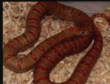
A gravid, reduced-black leonis phase L. m. leonis .