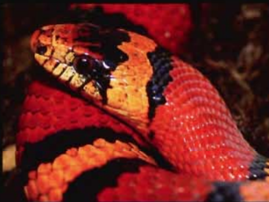
Orange milk snake phase of L. m. leonis .