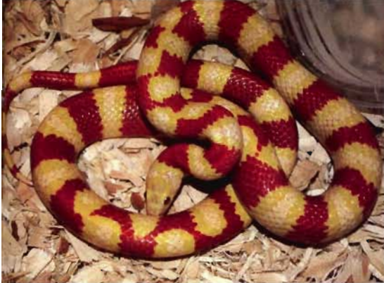
Yellow amelanistic of L. ruthveni .