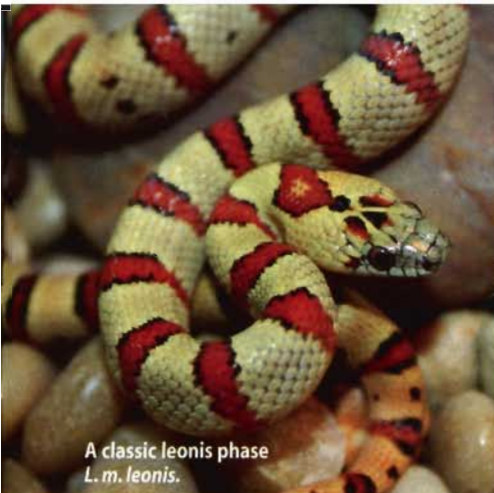
A classic leonis phase L. m. leonis .