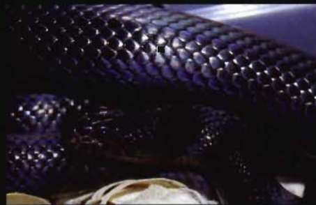
Melanistic L. m. leonis .