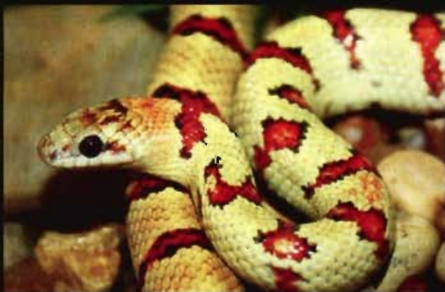
Yellow leonis phase L. m. leonis .