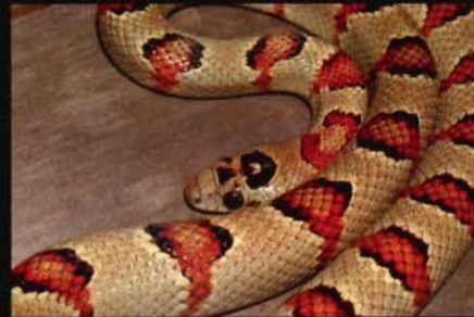
Tan leonis phase Lampropeltis mexicana leonis "thayeri."