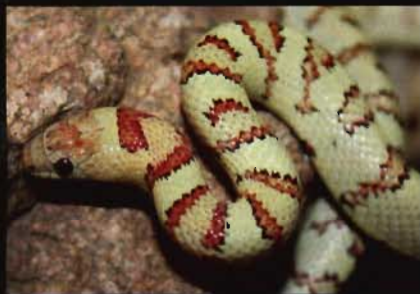
Yellow leonis phase L. m. leonis with hallow/ghost saddles.