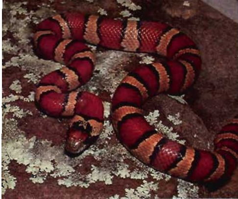
Tangerine milk snake phase of Lampropeltis mexicana leonis .