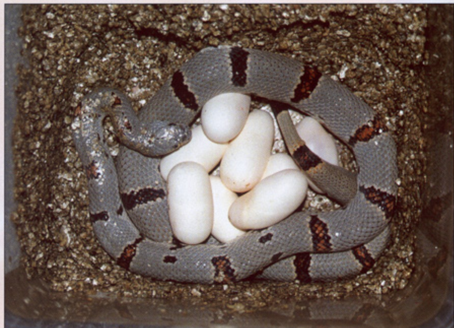
Female alterna morph Lampropeltis alterna coiled around a newly deposited clutch of eggs