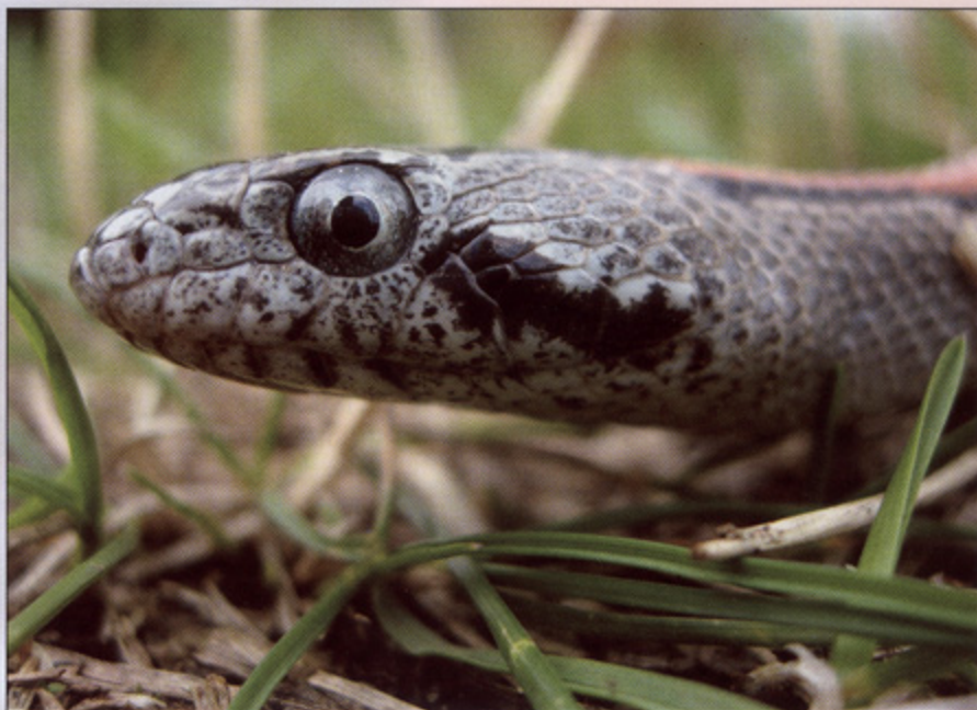
Lateral view of the head of a male blairi morph Lampropeltis alterna

About 10 days after hatching the babies shed and are ready for their first meal. Lampropeltis alterna hatchlings are predisposed to feeding on small lizards, which can be a problem for terrarium keepers to supply. Very few hatchlings will take pinky mice from the start; most will have to be trained to do this in