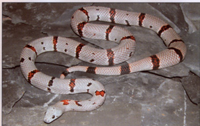
Male alterna morph Lampropeltis alterna . The alterna colour morph is characterized by relatively narrow black bands split by reddish-orange bands, and with alternating broken bands between them.

Sexually mature specimens housed together usually begin courtship behaviour and copulation 4–6 weeks after emerging from hibernation. Mating lasts 2–4 weeks (MERKER and MERKER, 1996). Gravidity