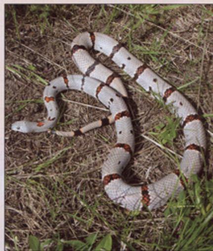
Male alterna morph Lampropeltis alterna

Since the early 1970s the number of captive-bred hatchlings produced each year has been steadily increasing, and knowledge and husbandry techniques are being refined. Still, we have many problems to solve regarding the captive husbandry of Lampropeltis alterna . For example, in clutches from wild-caught gravid females, egg fertility of almost 100