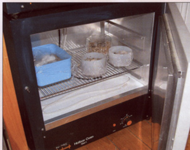
Incubator used by the author