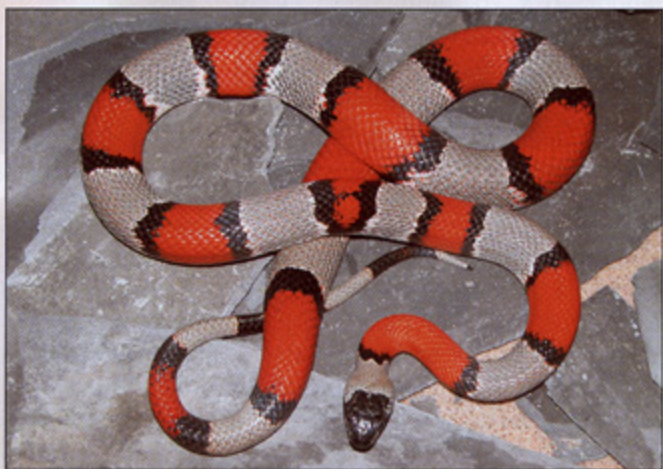
Male blairi morph Lampropeltis alterna . The blairi colour morph is characterized by relatively few broad orange saddles with no alternating broken bands between them.