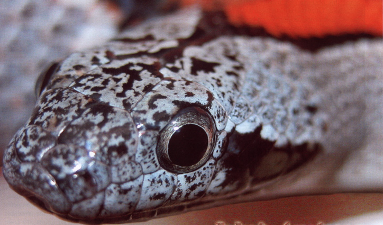
Close-up of a male blairi morph Lampropeltis alterna