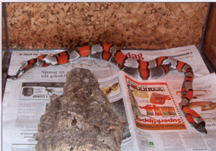
Copulating blairi morph Lampropeltis alterna pair. The lighter coloured male is on top

still in my collection, to which a couple more breeding pairs have been added; and my family, for putting up with my snake hobby over the years.