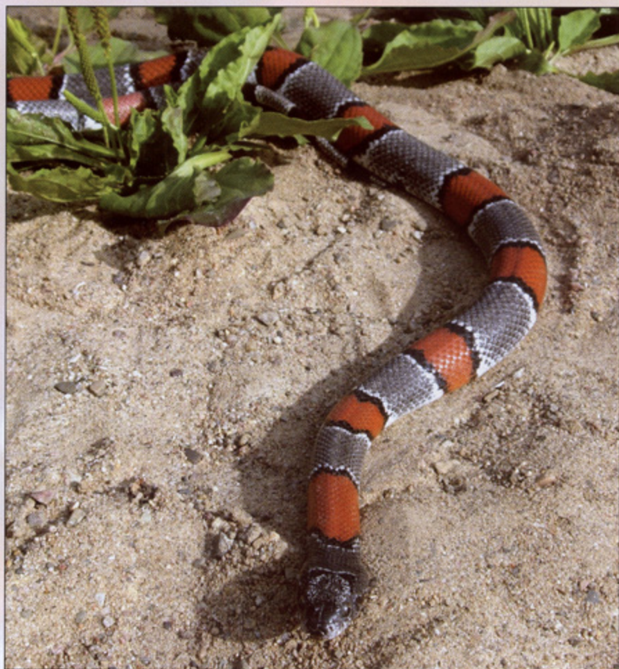
Female blairi morph Lampropeltis alterna

Two colour morphs are recognized, commonly referred to as the alterna and blairi morphs (MILLER, 1979). The alterna morph has 17–33 narrow black crossbands bordered by narrower white bands on a grey background. These black bands may or may not be split by reddish-orange bands, and there may or may not be alternating reduced or broken black bands between the main bands. The blairi morph is characterized by 12–15 broad orange saddles with narrow black borders and adjacent white bands on a grey background. The blairi morph has no alternating broken