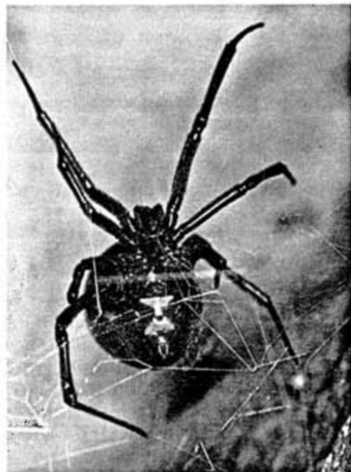
AT LEFT: Yellow-headed collared lizard. ABOVE: Black widow spider. Both creatures are targeted by poachers.

In an era when law enforcement dollars are stretched thin and the worldwide appetite for rare species continues to grow, wildlife—whether it has antlers, fur, feathers, or scales—is falling prey to greed.