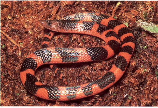
Fig. 484. Geophis duellmani , male, 192 mm TL (UTA R-12333); 6.8 km south of Vista Hermosa (north slope of the Sierra de Juárez), Oaxaca, Mexico, 1661 m elevation.