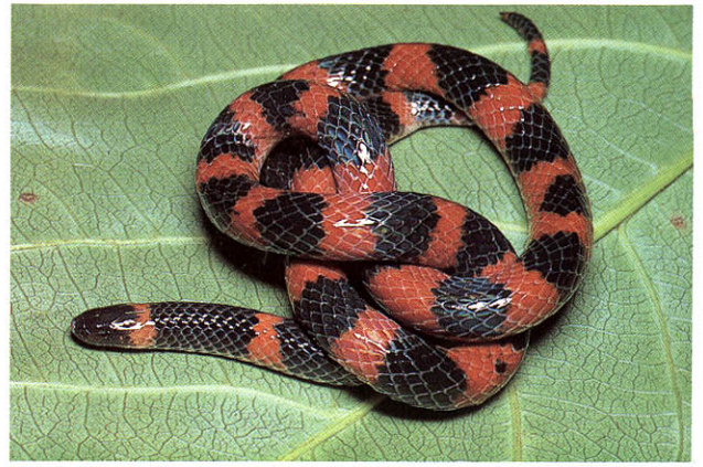
Fig. 485. Geophis semidoliatus , female, 314 mm TL (UTA R-19910); Parque Moctezuma, Barranca de San Miguel, Cuautlalpan, Veracruz, Mexico.