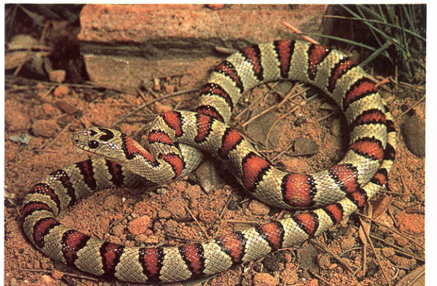
Fig. 489. Lampropeltis mexicana greeri ; vicinity of Coyotes, Durango, Mexico.