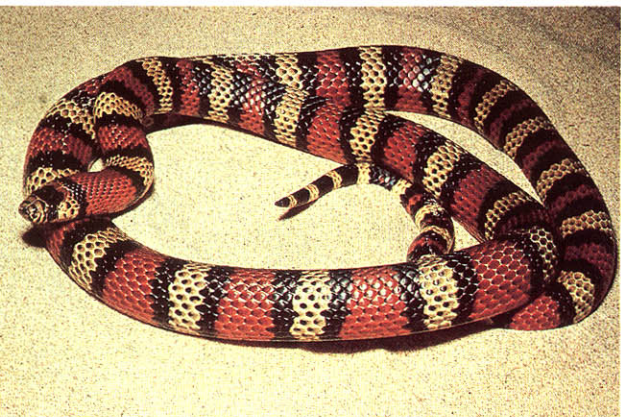
Fig. 490. Lampropeltis triangulum andesiana , male, 1,448 mm TL; El Alto del Oso, vicinity of El Parque Nacional Natural La Cueva de los Guácharos, Huila, Colombia, 2,000 m elevation.