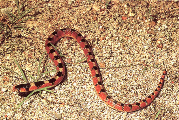
Fig. 486. Gyalopion quadrangulare ; Carretera Estatal (State Highway) 23, Sinaloa, Mexico.