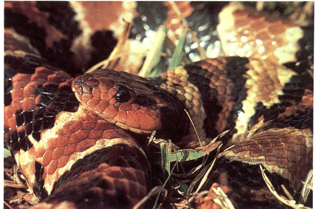
Fig. 487. Hydrodynastes bicinctus , male, approximately 1,500 mm TL; El Tapón, Caño La Hormiga, Vichada, Colombia.