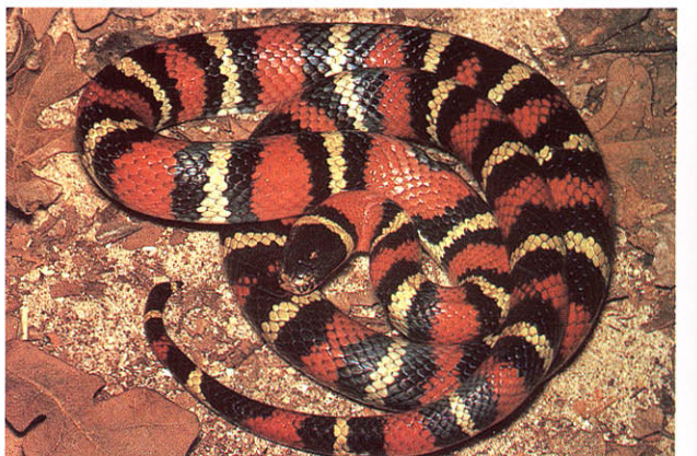
Fig. 491. Lampropeltis triangulum arcifera , male, 890 mm TL (UTA R-12345); 2.4 km northwest of Tapalpa, Jalisco, Mexico, approximately 2,134 m elevation.