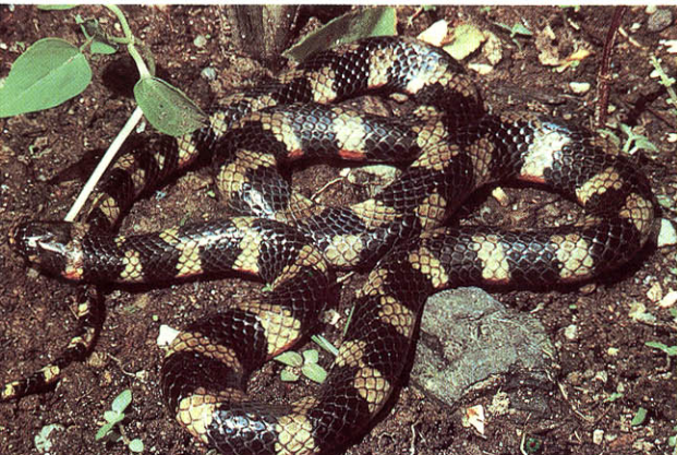
Fig. 488. Hydrops triangularis venezuelensis , female, 515 mm TL (WWL 1336); Finca El Acuario, Vereda Las Mercedes, Meta, Colombia, 450 m elevation.