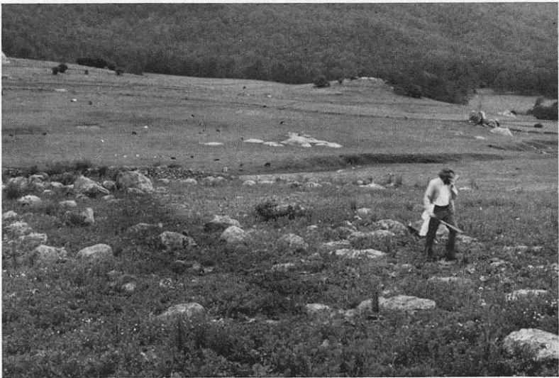
FIG. 21. Habitat of Crotalus polystictus . Rancho San Francisco, Jalisco, Mexico. Snakes were commonly found among boulders or in gopher burrows in grassy meadows with surrounding pine forest on hillsides.